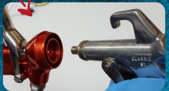
Dry with blow gun

When cleaning the spray gun manually, please ensure not to use brushes made of metal wires which could possibly damage the spray gun. Furthermore, please make sure that no cleaning fluid ends up in the air passages of the spray gun body.