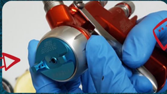
Followed by the air cap