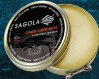
Lubricant grease Ref. 56418589