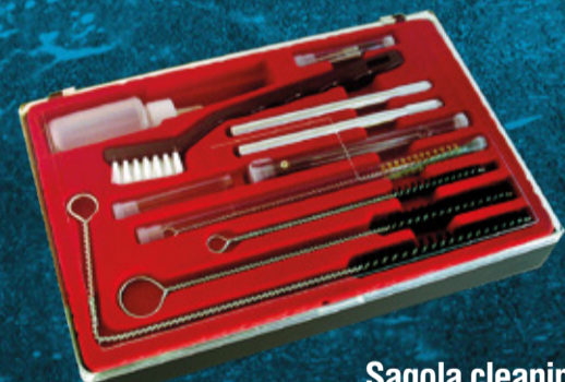
Sagola cleaning kit Ref. 40000086

Over the years, the silicone-free SAGOLA high performance spray gun grease, which is compatible with paint has proven to be the perfect maintenance agent when thinly applied on all moving components as well as on all threads. This ensures free movement and perfect function of the components, even after many years of use.