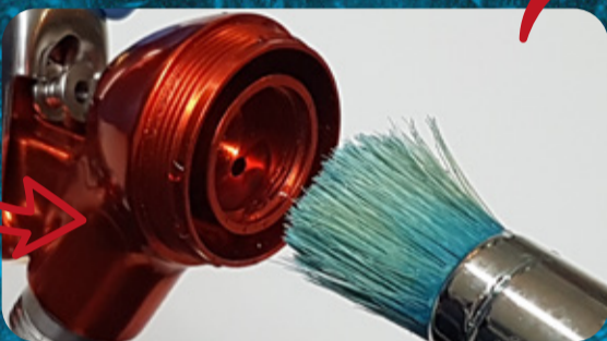
Clean the spray gun body