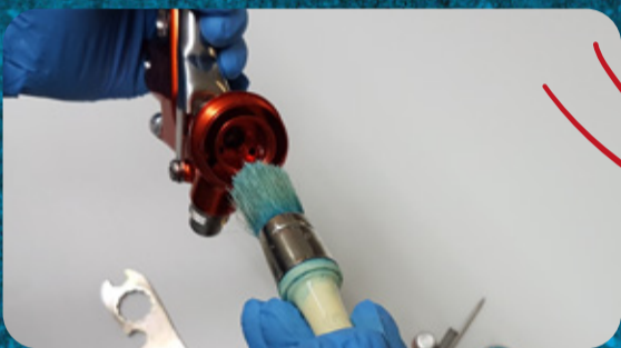
Clean the material passage