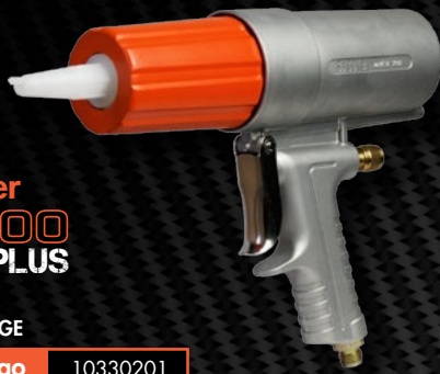
Sealer 3900 PLUS

Pneumatic sealers are a compact, efficient and light solution for everyday needs in any workshop. These pneumatic guns are very useful when it comes to structure assembling, repairs and windshield set-ups, amongst others.