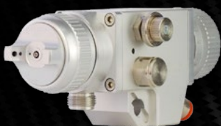
V4 Buses: 1.0 to 2.8