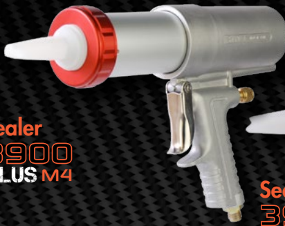
Sealer 3900 PLUS M6