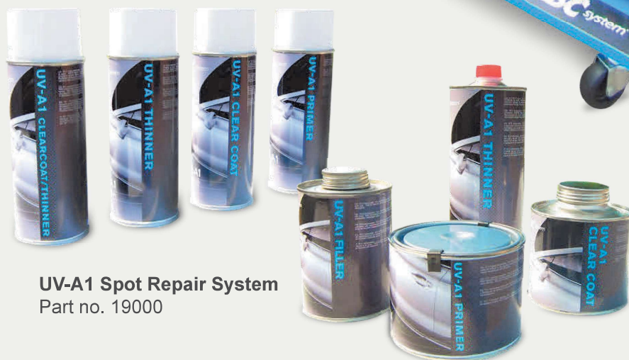
UV-A1 Spot Repair System Part no. 19000

Traditional Spot repairs can take between 45-60 minutes, excluding curing time. Larger repairs which need filling can take even longer!